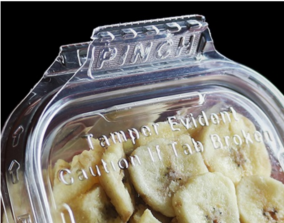
Consumer Alert Message