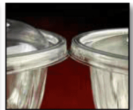
Two Lid Options