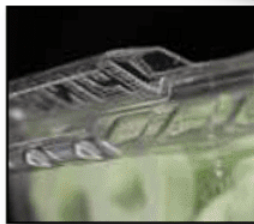
Tamper-Evident Raised Hinge