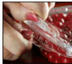
Easy-Opening Hinge Tabs