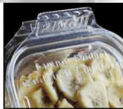
Consumer Alert Message