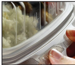
Intuitive Opening Tabs