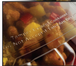
Consumer Alert Message