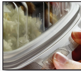
Intuitive Opening Tabs