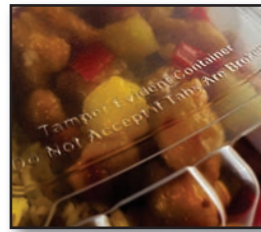
Consumer Alert Message