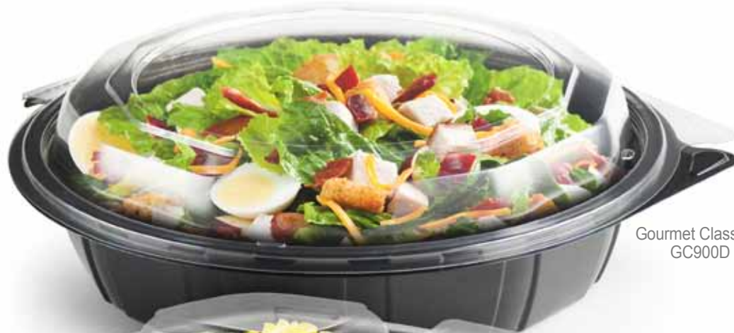
Gourmet Classics™ GC900D